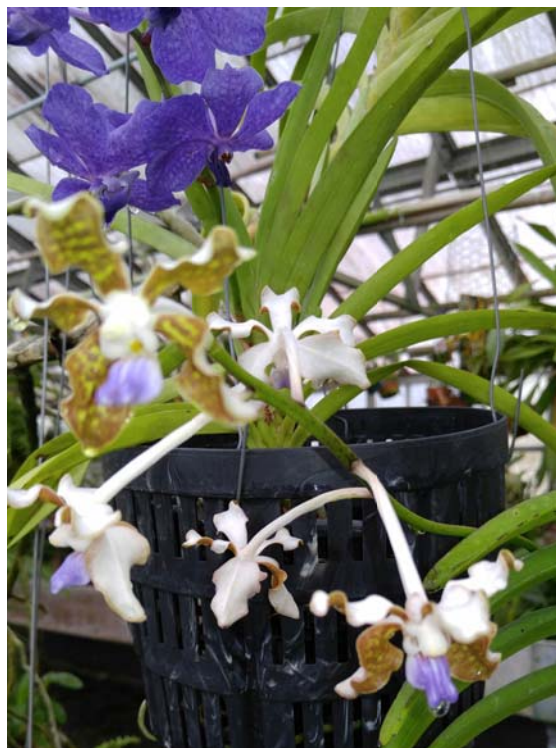
Both plants from our Greenhouse.