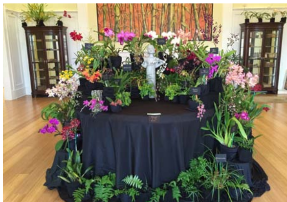
Display from 2016 Show

The 2017 Annual Orchid Show will be held at the Coastal Georgia Botanical Gardens on April 28 - 30, 2017. We have commitments from six vendors; Marble Branch Farms, Live Oak Orchids, Owens Orchids, Johns Island Orchids, Oglethorpe Orchids, and EFG Orchids. There's lots more to come, so start getting ready.