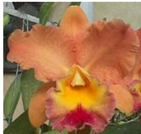
Blc. Goldenzelle 'Orange Pumpkin'

Bundle up (as I type this, it's in the high 80's outside... sigh!) David Jarrell