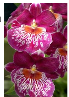
Miltoniopsis Martin Orenstein

This marks the beginning of the flowering season. Amazing displays of color will dazzle the grower over the next few months. Prepare your plants for optimum display by staking spikes (if needed) and cleaning off the older yellow foliage. Do not miss the wonderful fragrance as the flowers unfold. Milto