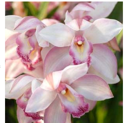
Cymbidium Magic Mountain

Plants should be putting on a spectacular show this time of year. Adjust all staking and twist-ties and be on the lookout for aphids, slugs and snails. Give adequate water because flowering strains the plants. As new growths appear later, increase the nitrogen level in the fertilizer. Should a plant look healthy but not be blooming, try increasing the light during the next growing season. The number-one reason for no flowers is lack of light.