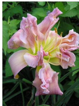
Wysiwyg