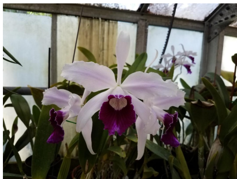
L. purpurata v. striata Greenhouse Photo