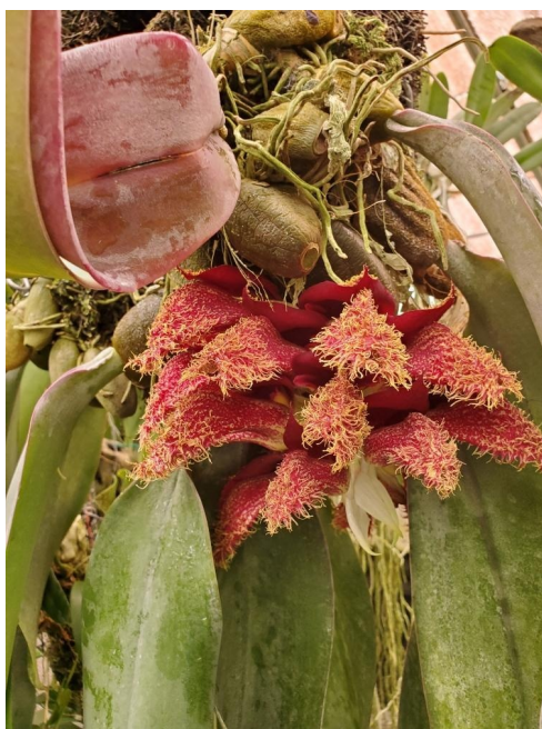
Bulbophyllum Phalaenopsis