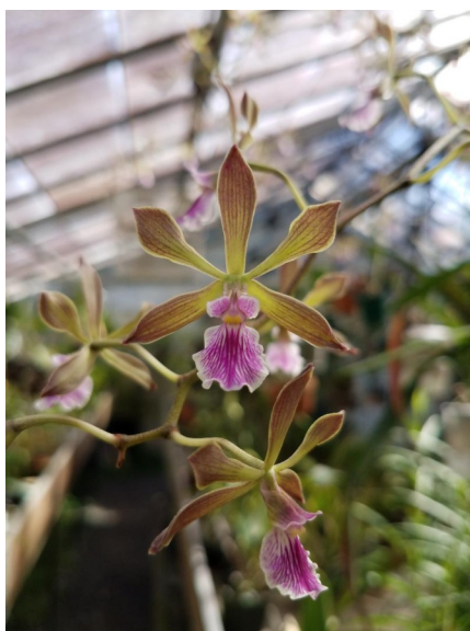
Encyclia Nursery Rhyme x Encyclia ceratistes