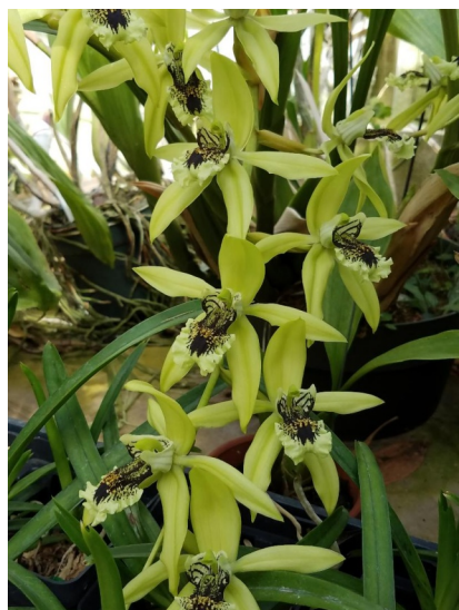
Coel. South Carolina