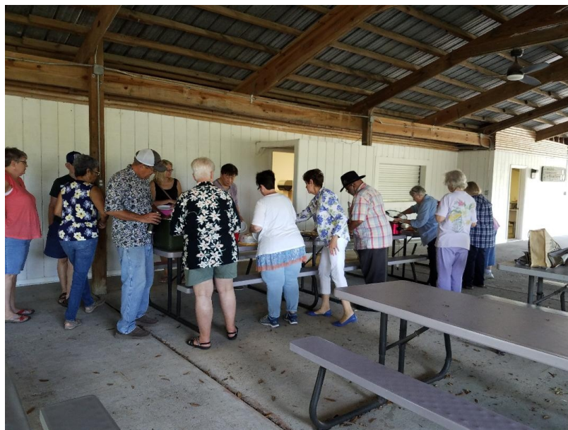
Time to Eat!