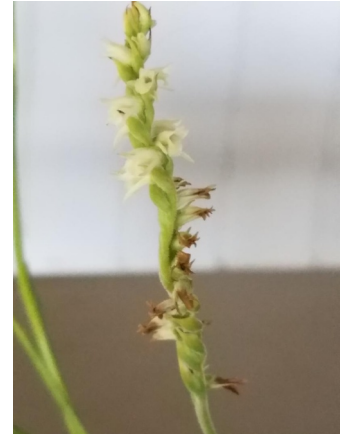
Native Orchid, Spiranthes magnicamporum?, Owner: Steve Tacopina