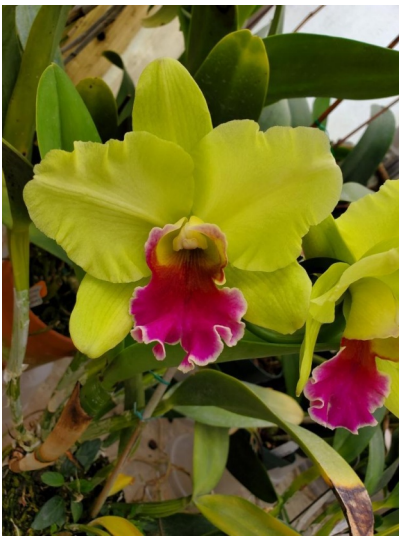
Blc. Mem. Helen Brown 'Sweet Afton'

**Article was from Waldor's Orchids 16 May 2022 email.