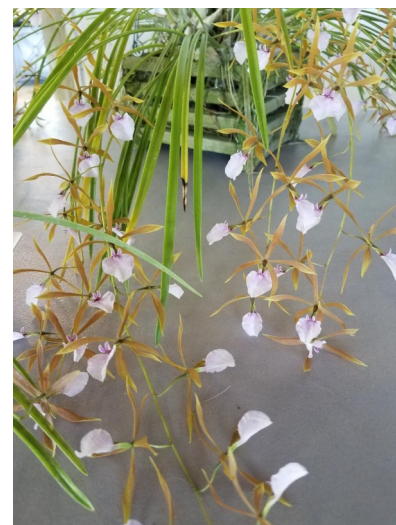
Encyclia bractencens, Owner: ???