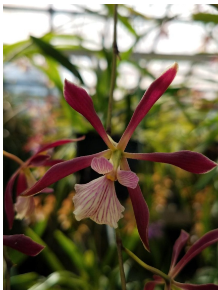
Encyclia Boricana (bractescens x alata)