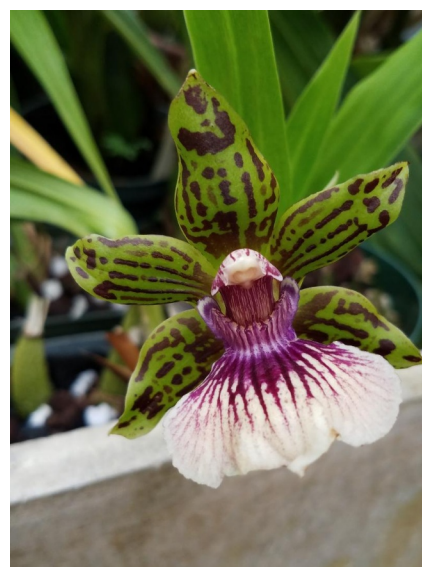
Galeopetalum Starburst Parkside AM/AOS