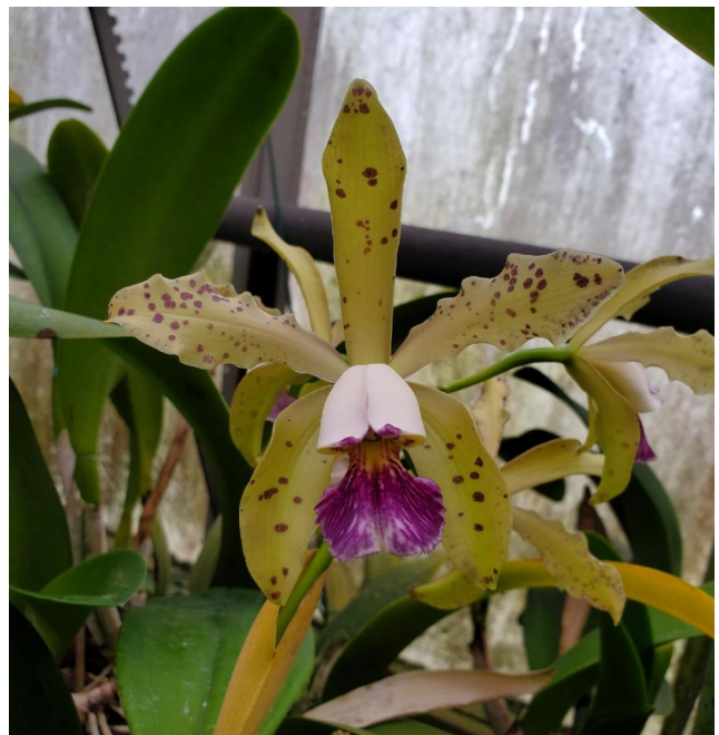
C. Leodigglossa x C. schilleriana coerulea, Owner: