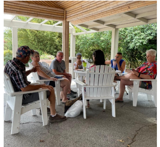
June Board Meeting