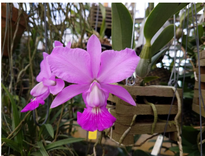
Cattleya walkeriana rubra

But the Cattleya walkeriana Are Reigning Supreme