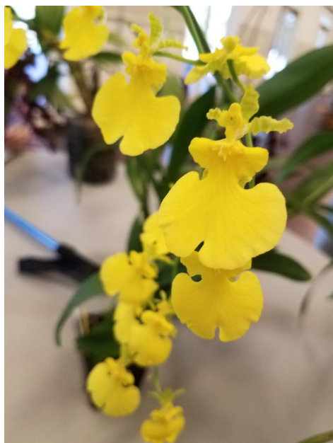
Oncidium Sweet Sugar 'Lemon Drop', Owner: Debra Lahey