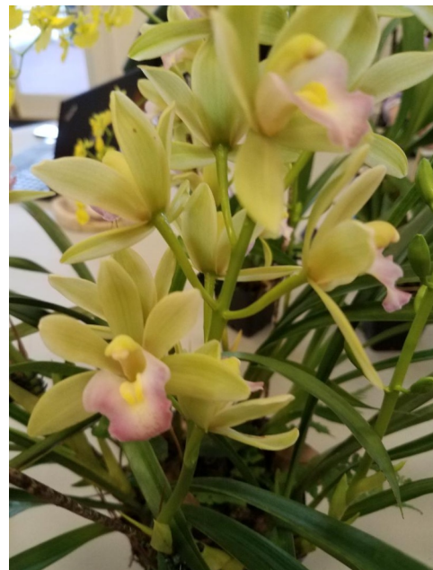
Cymbidium Sweetheart 'Spring Pearl', Owner: Debra Lahey