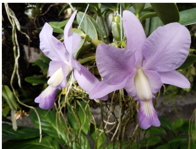
Cattleya walkeriana 'Edward'