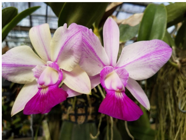
Cattleya walkeriana Aquinii 'Gifa'