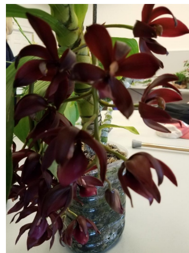
Cycnodes Wine Delight, Owner: Noel Gielegem