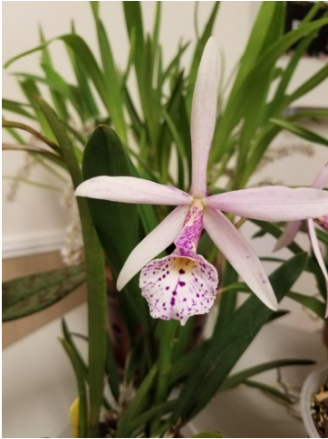
Bc. Sunset Glory; Owner: Unknown