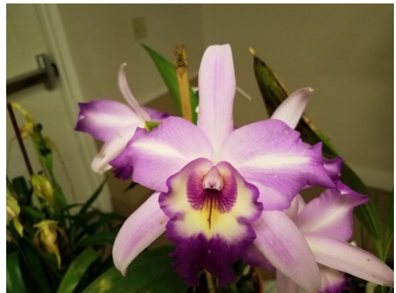
Rlc. Miss Wonderful "Imperialis";