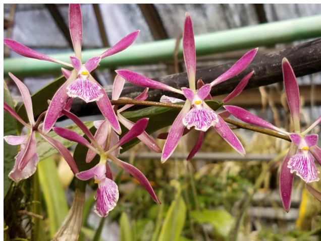
Encyclia adenocaula Greenhouse