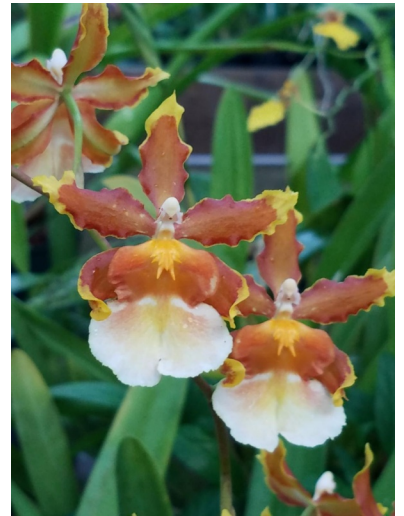
Oncidium - NOID

Please come out and support Friends of the Coastal Gardens.