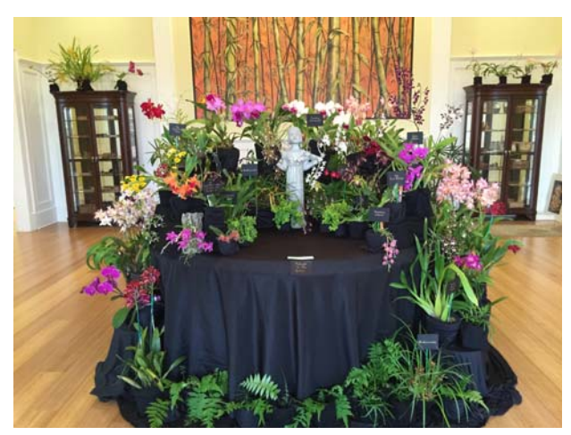
Display from 2016 Show

The 2017 Annual Orchid Show will be held at the Coastal Georgia Botanical Gardens on April 28 - 30, 2017. Start making your plans, start getting ready, start deciding what job you want, ... why don't you just go ahead and get everything started!